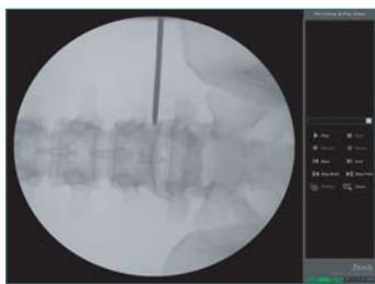
Real time display and save